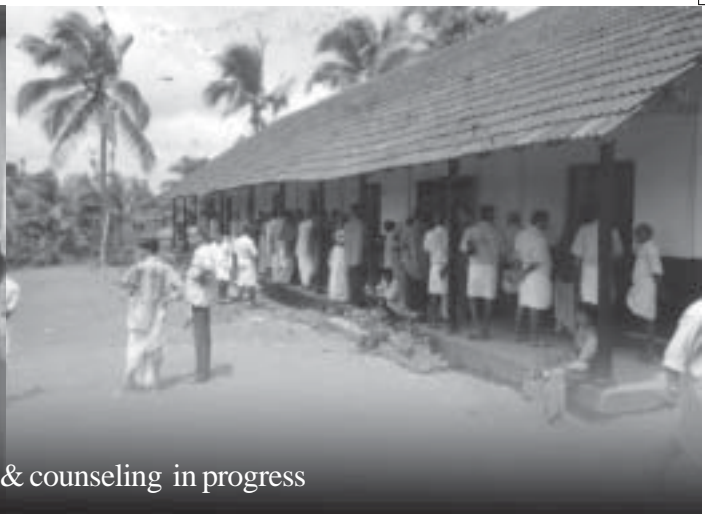
Pre-Adalath negotiation & counseling in progress