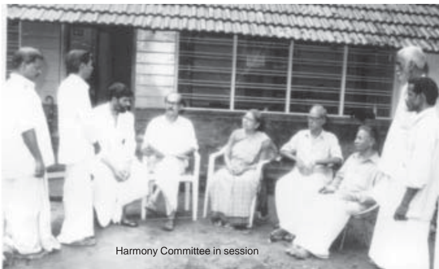
Harmony Committee in session