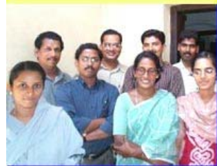
Part of the team